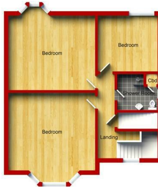
First Floor Approximate Floor Area (72.50 sq.m)